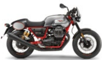
V7 III RACER Racer