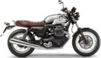
V7 III ANNIVERSARIO Anniversario