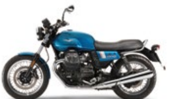
V7 III SPECIAL Azzurro Zaffiro