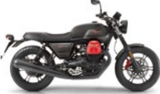
V7 III CARBON Dark