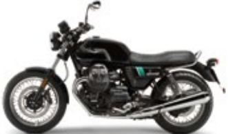
V7 III SPECIAL Nero Inchiostro