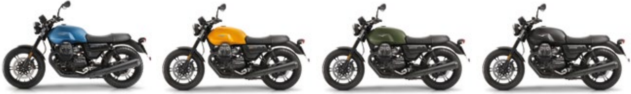
V7 III STONE Azzurro Elettrico