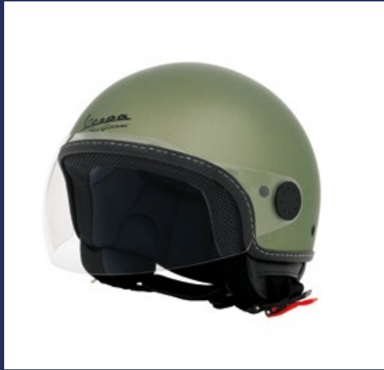
LIMITED EDITION HELMET