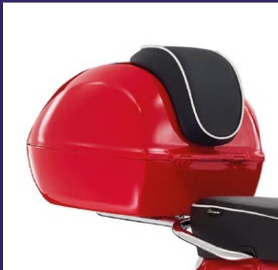
PAINTED TOP BOX