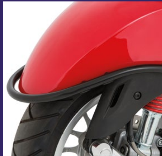
BLACK MUDGUARD PROTECTION