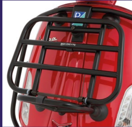
BLACK FRONT LUGGAGE RACK